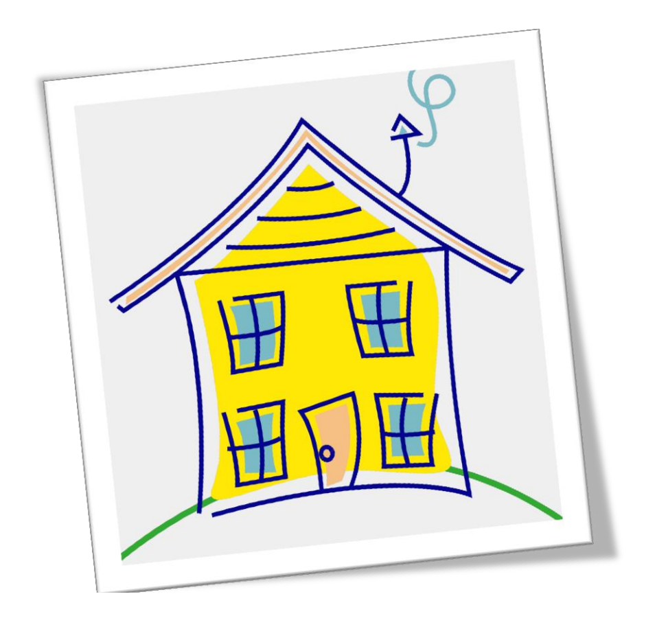
Parents' Role in PRIDE